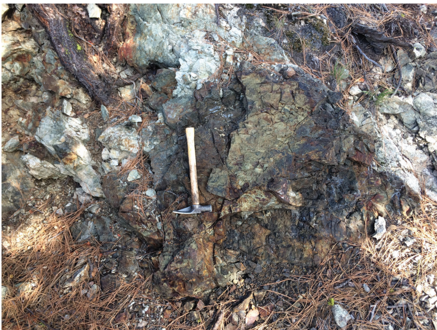
Bonanza Main Skarn Outcrop